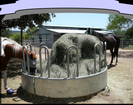
This photo shows a bale half eaten