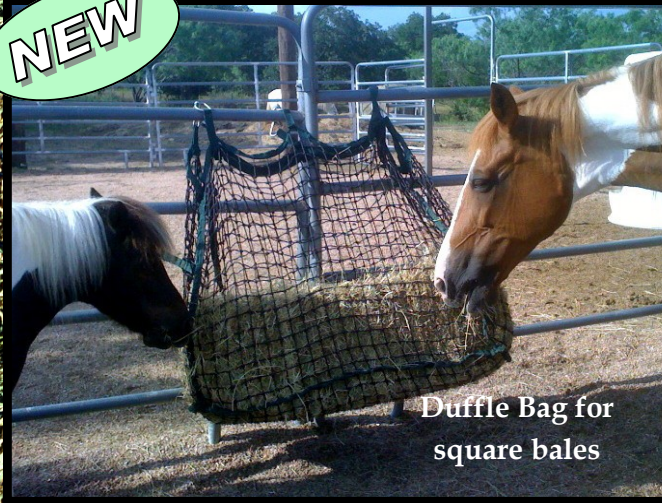
Duffle Bag for square bales